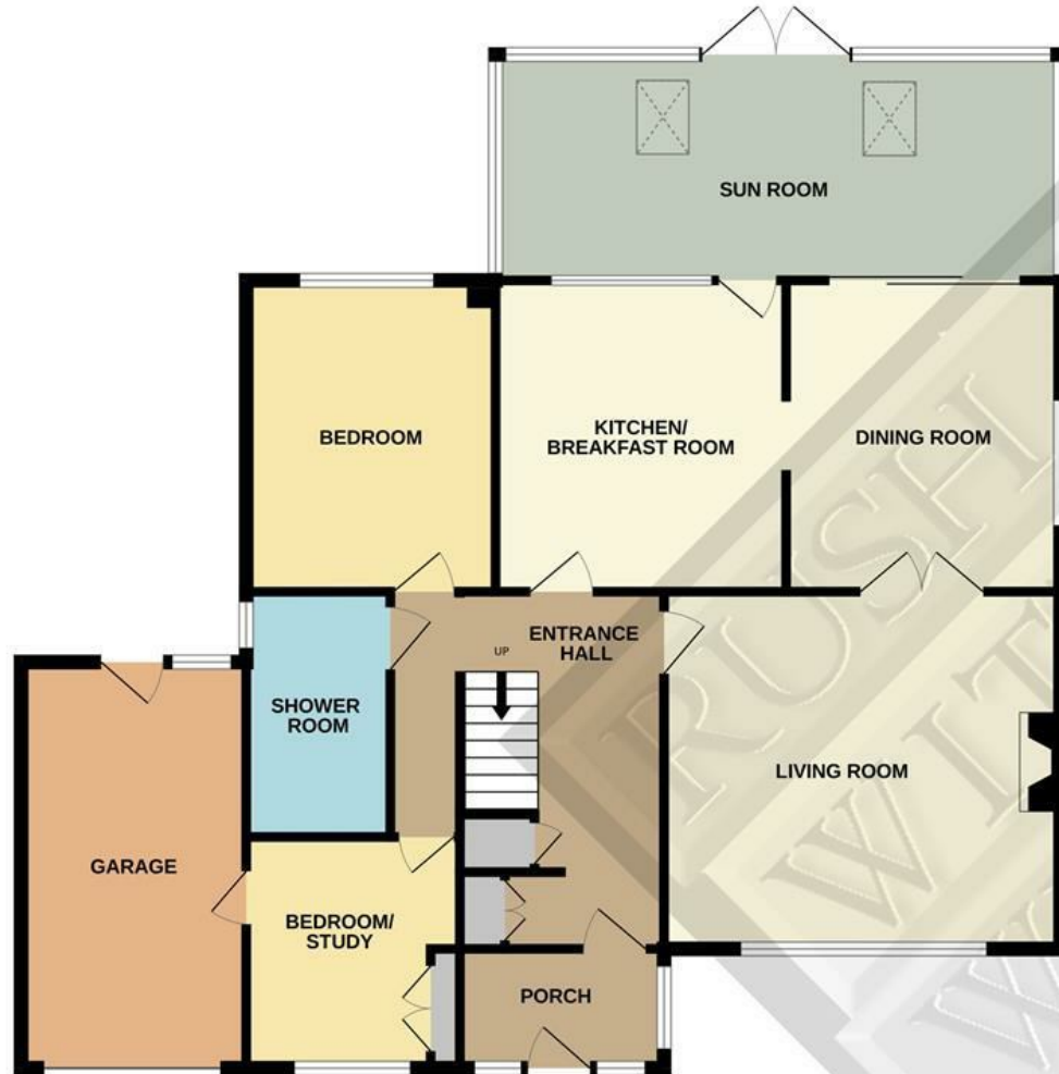
GROUND FLOOR 1302 sq.ft. (121.0 sq.m.) approx.